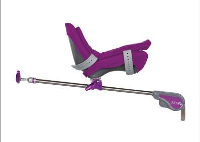
250 Junior Lithotomy Stirrups