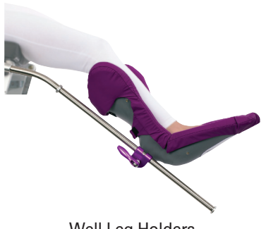
Well Leg Holders