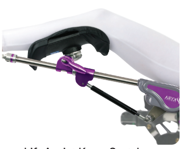
Lift Assist Knee Crutches