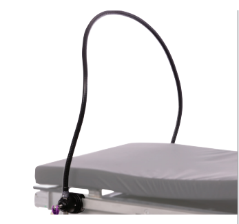
Flexible Anesthesia Screens