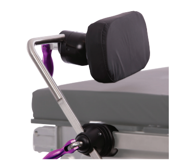
Secondary Shoulder Supports