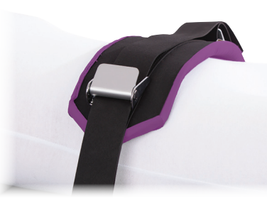
Patient Safety Straps