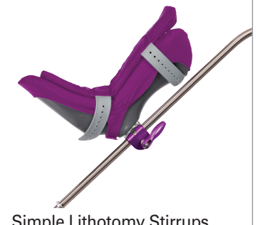
Simple Lithotomy Stirrups