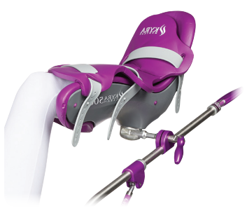
Clean™ Lithotomy Stirrups